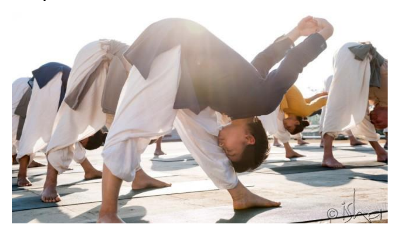
Questioner: What is the importance of the sequence in which we are doing the asanas? Can we change the order?